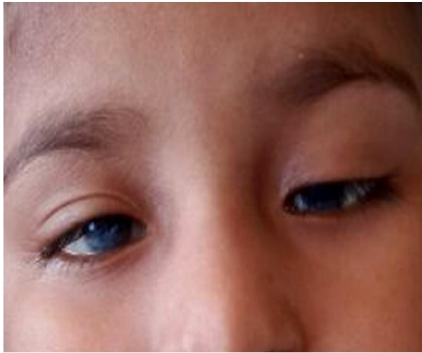
Figure 1: Microphthalmos, Microcornea, Strabismus, Corneal clouding