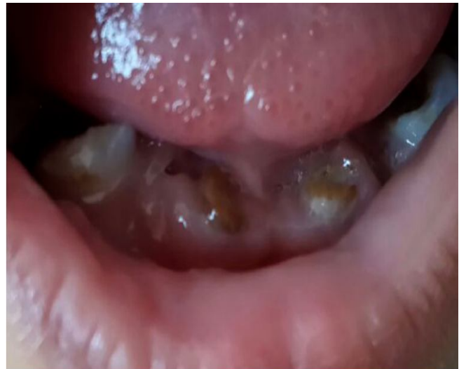
Figure 4: Missing 72, 73, 82, 83 and Ankyloglossia