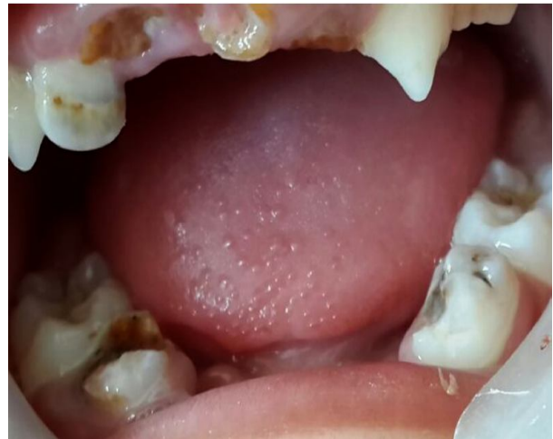
Figure 6: Multiple decayed teeth