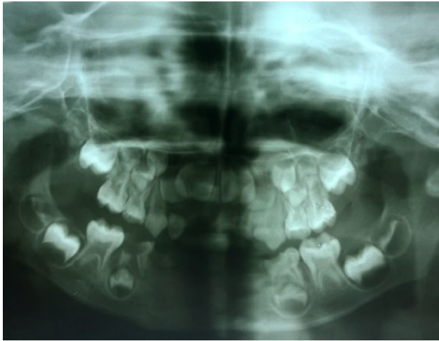
Figure 5: OPG showing absence of permanent lower anterior tooth buds